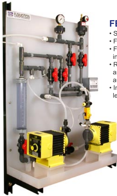
PP-2 Dual Pump System