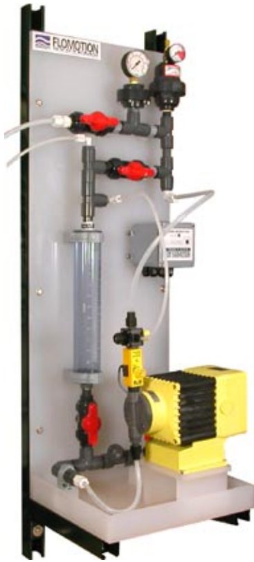
PP-1 Single Pump System