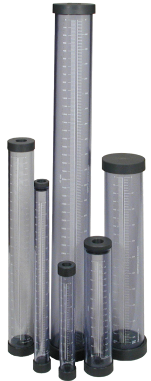
Calibration Cylinders are available in eight sizes.

Cap is sealed with an O-ring and includes an NPT vent connection. Used in applications where frequent cleaning is required, such as polymer, alum, ferric chloride or chlorine.